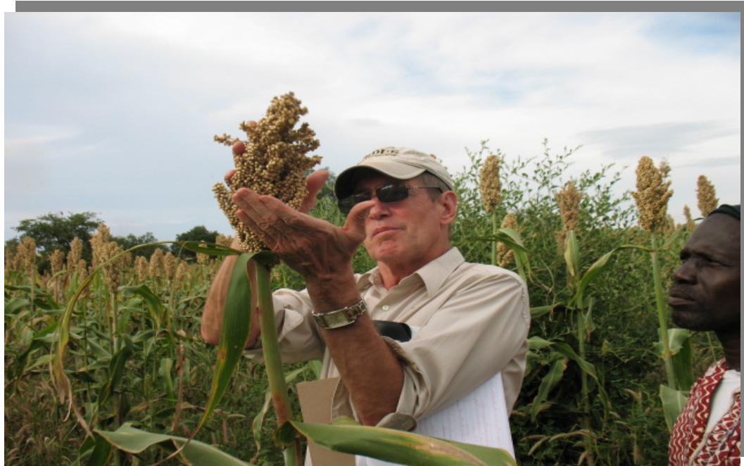
Picture 9. An economist doing an impersonation of an entomologist checking for head-bugs in Segoufa in Kolokani, 2009.

In Tingoni they have now graduated as a functioning farmers' association. They have introduced the new technologies and marketing methods and have sufficient size to keep going as a marketing coop buying inputs and selling millet for their members. They have good contacts with the millet food processors in Bamako and are able to get bank financing on their own. They have excellent agronomic support from Sasakawa 2000. They are also being supported by the AGRA program in 2009.