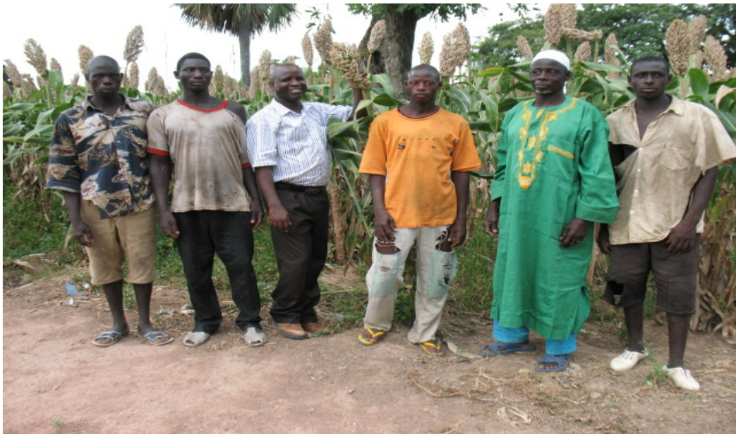
Picture 4. A group of farmers increasing seed of Grinkan for planting in 2010.