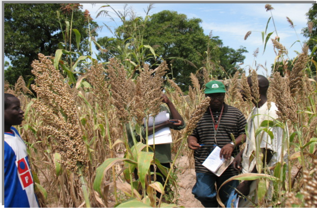
Picture 6. Niaticama grown in Wakoro (Dioila, 2009) by farmers at high density demonstrates excellent yields.

In Kolokani and Jangounte Camara, Seguifa has done very well in 2009, even though it had to be planted late and/or replanted due to the erratic rainfall at the start of the season. This early Caudatum suffered in 2008 from the late rainfall resulting in the head bug-mold problem. The mold was apparently an important factor explaining the poor germination from the seeds from Kolokani planted in the Segou-Bla region in 2009. We are checking after the harvest of 2009 the farmers' response to Seguifa in Segou-Bla. In spite of the poor germination and replanting by many farmers from our field visits it appears that with the late planting, there will be good yields in the region (see photos). If farmers are interested, we will be working with Faso Jigui (a farmers' cooperative) to obtain credit for a substantial area expansion. M. Diourte of IER has organized the seed production of this cultivar in 2009 for this area expansion. 2