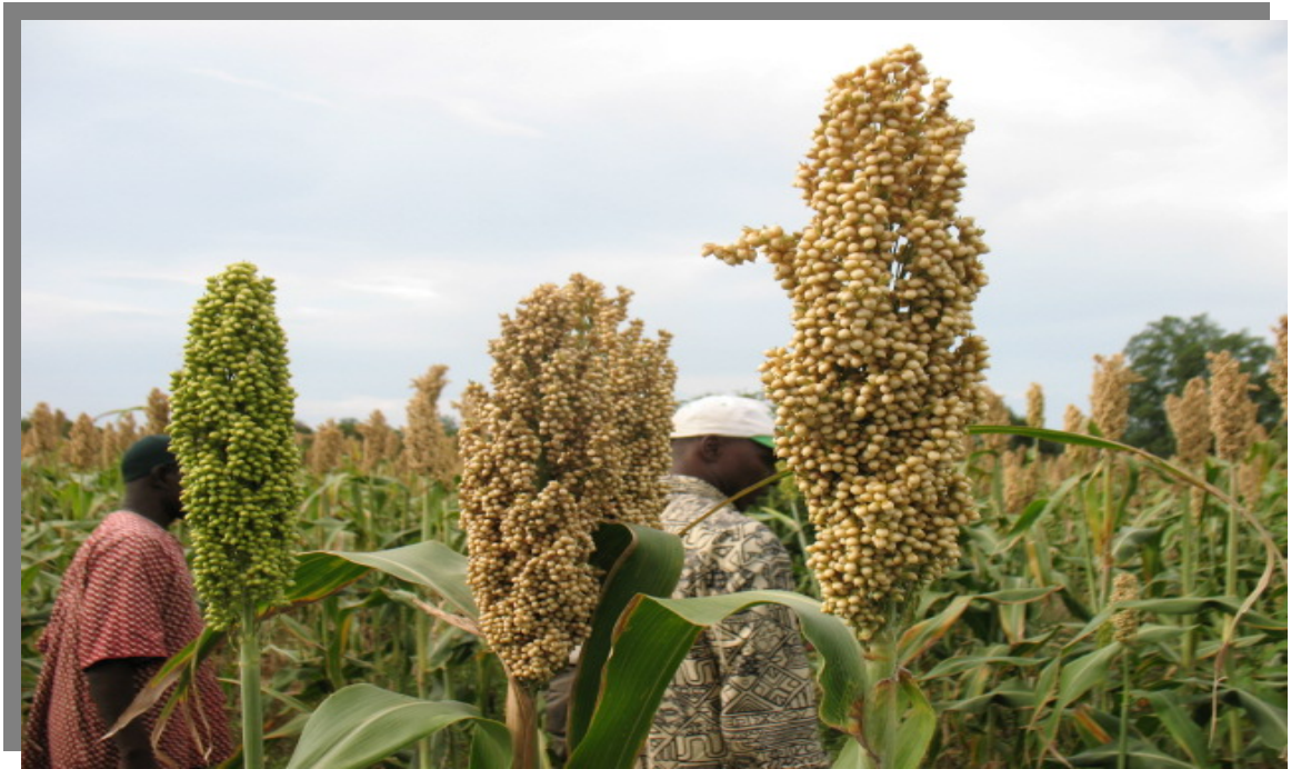
Picture 7. Seguifa sorghum heads in Jangounte Camara (Kayes region 2009)