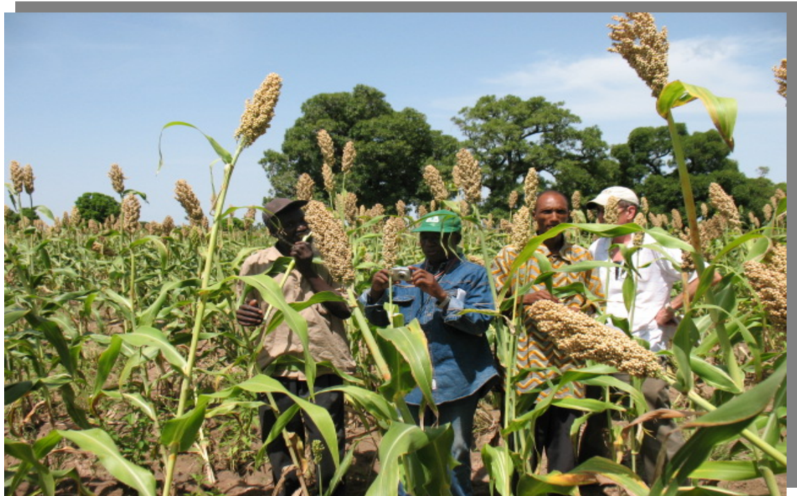
Picture 8. Farmers and Production-Marketing personnel in a Seguifa field, Kolokani region