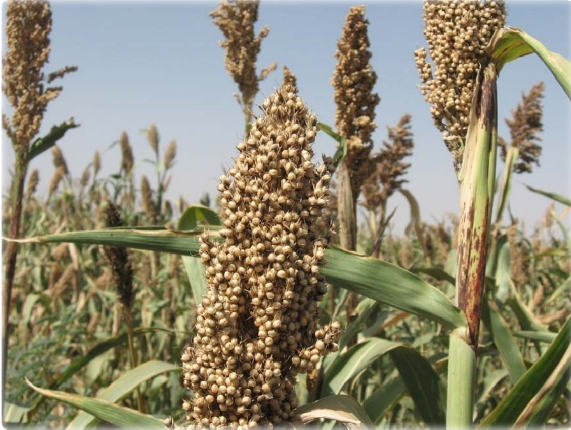
Décrue sorghum panicles (“Niatichama”) in INTSORMIL/IER studies in a farmer’s field, Bintagougou, Tomboctou Region, Mali.