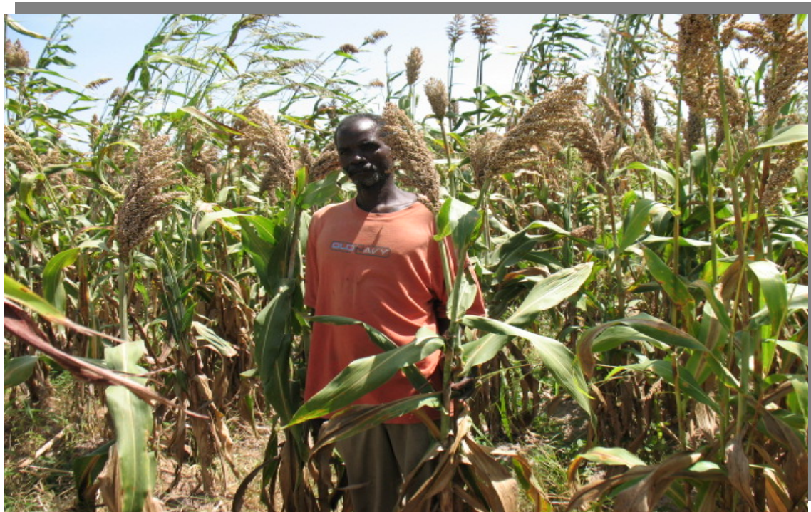
Picture 5. This farmer (from Nangola village, Dioila) grew Niaticama for the first time and he is pleased with both the head type and the height. Notice the number of off-types in the Niaticama photos. This problem will be addressed in 2010