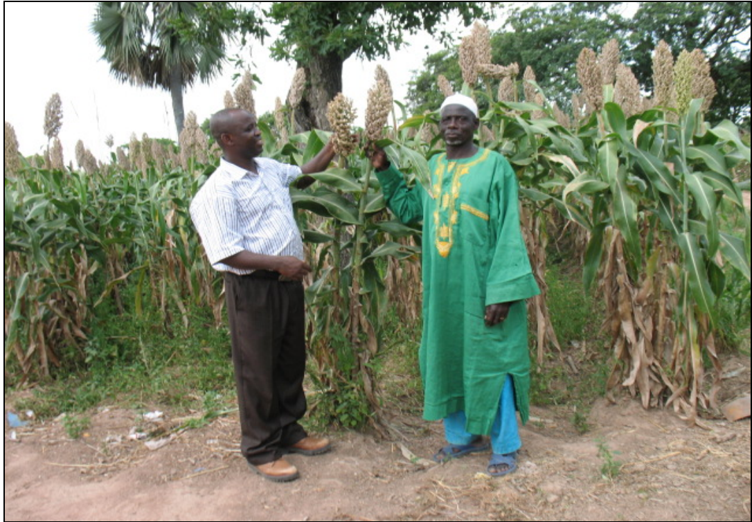
Picture 3. A farmer and the head of the NGO, AMEDD, visiting a seed production plot of Grinkan in Garasso, Koutiala region. This cultivar is now being produced on more than 150 ha in 2009.